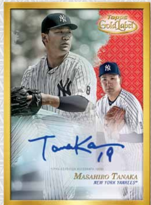
Framed Autograph Card - Red Parallel

MAKE YOUR PURCHASE FOR 2017 TOPPS GOLD LABEL TODAY PRODUCT AVAILABLE IN SEPTEMBER 2017