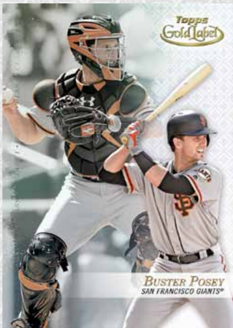
Class 1 Card

Class 1 – 1/1 Class 2 – 1/1 Class 3 – 1/1