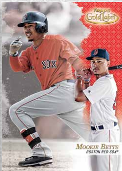
Class 2 Card - Red Parallel