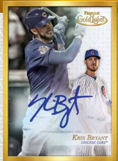
Framed Autograph Card

Black Refractor - #'d to 5 Gold Refractor - #'d 1/1