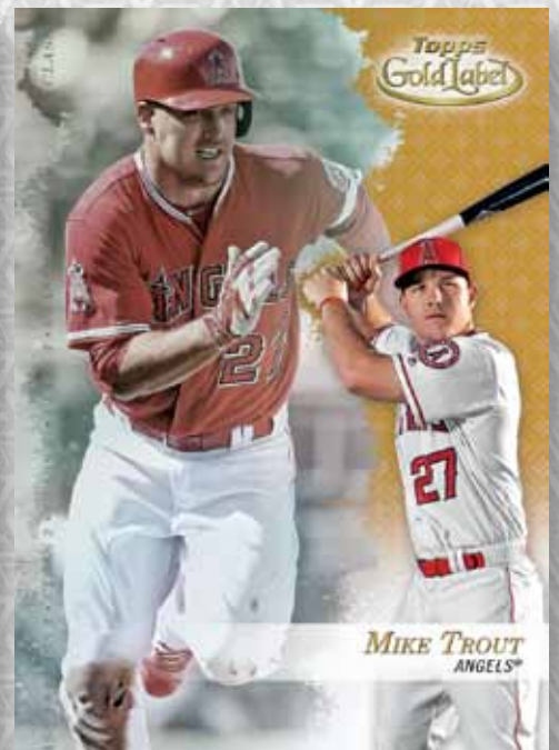
Class 3 Card - Gold Parallel