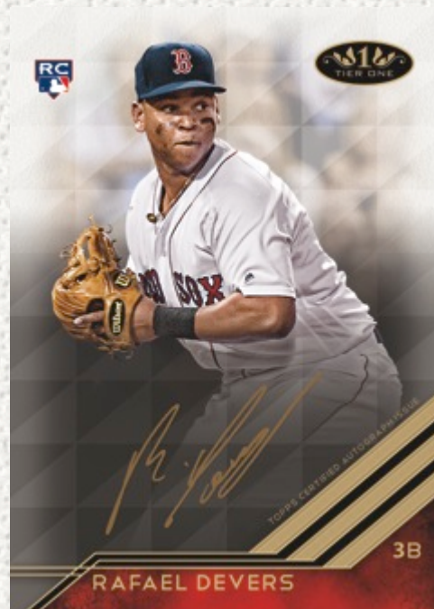
Break Out Autograph Card – Bronze Ink Parallel