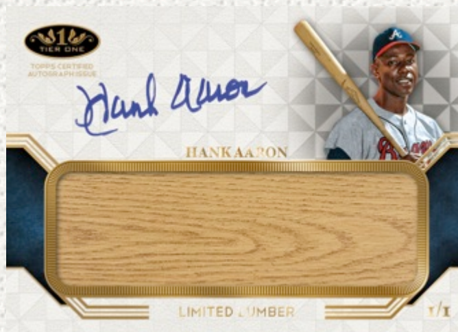
Autographed Limited Lumber Card