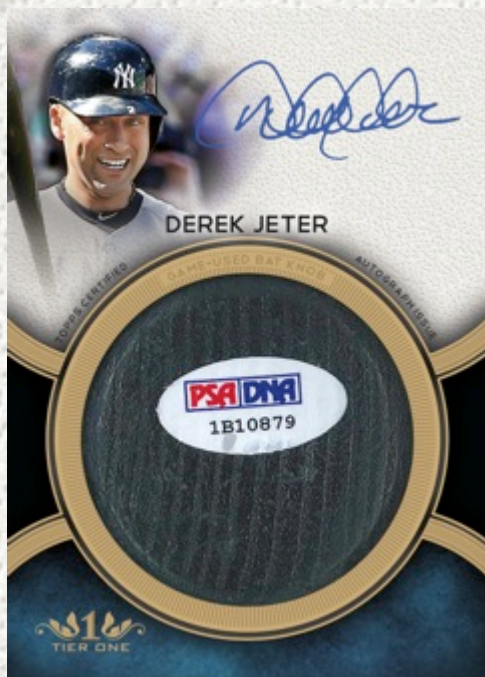
Tier One Autographed Bat Knob Card