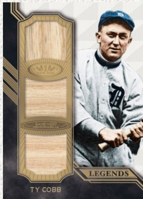
Tier One Legends Relic Card