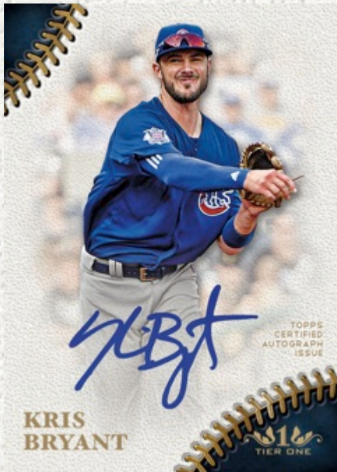
Prime Performers Autograph Card

25 1-of-1 cards containing a vintage cut signature from one of the game’s all-time greats.