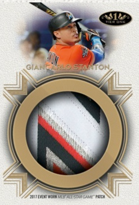
Tier One All-Star Patch Card