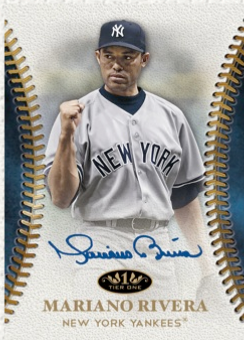
Tier One Autograph Card