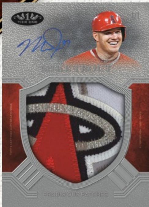
Autographed Prodigious Patches – Platinum Parallel