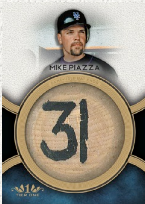
Tier One Bat Knob Card