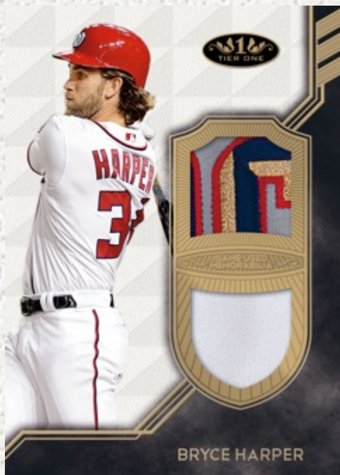
Tier One Relic Card – Dual Relic Parallel