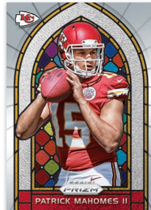
STAINED GLASS PRIZM

Look for stunning new inserts featuring the league's best past, present and future superstars! Chase rare Gold Mojo and Black Finite parallels!