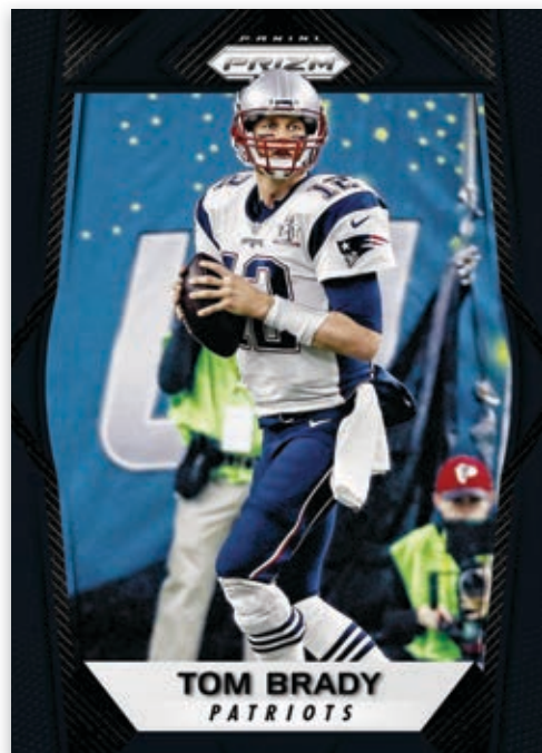
BASE BLACK FINITE