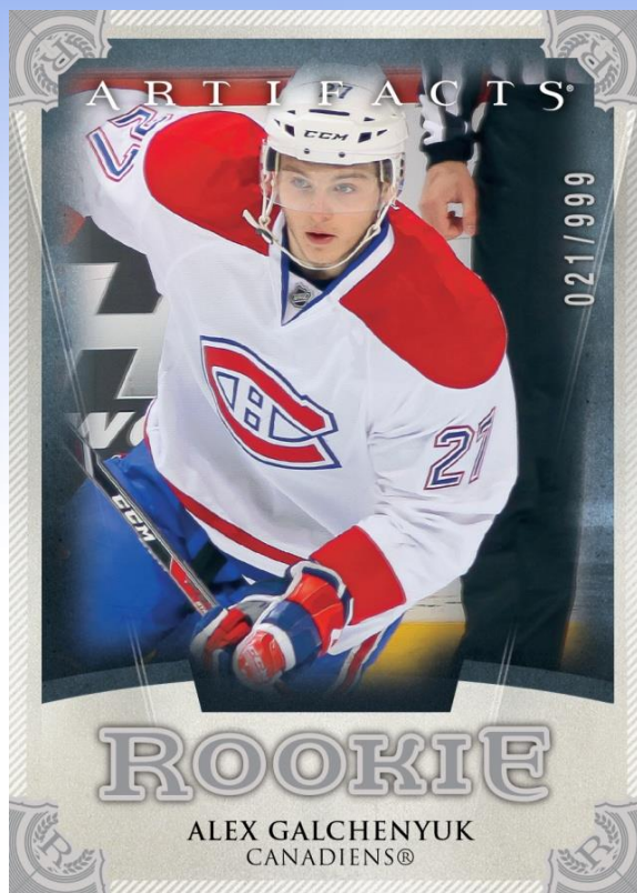
Artifacts Rookie Card