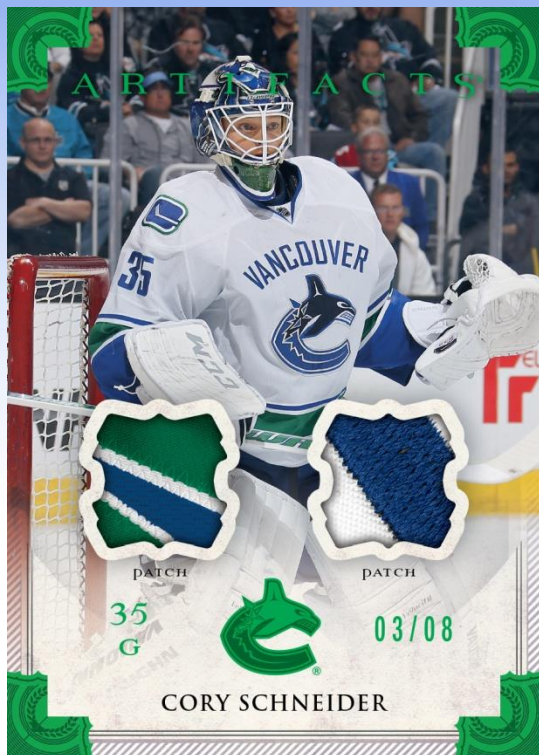
Goalies Material Emerald Patch-Patch parallel