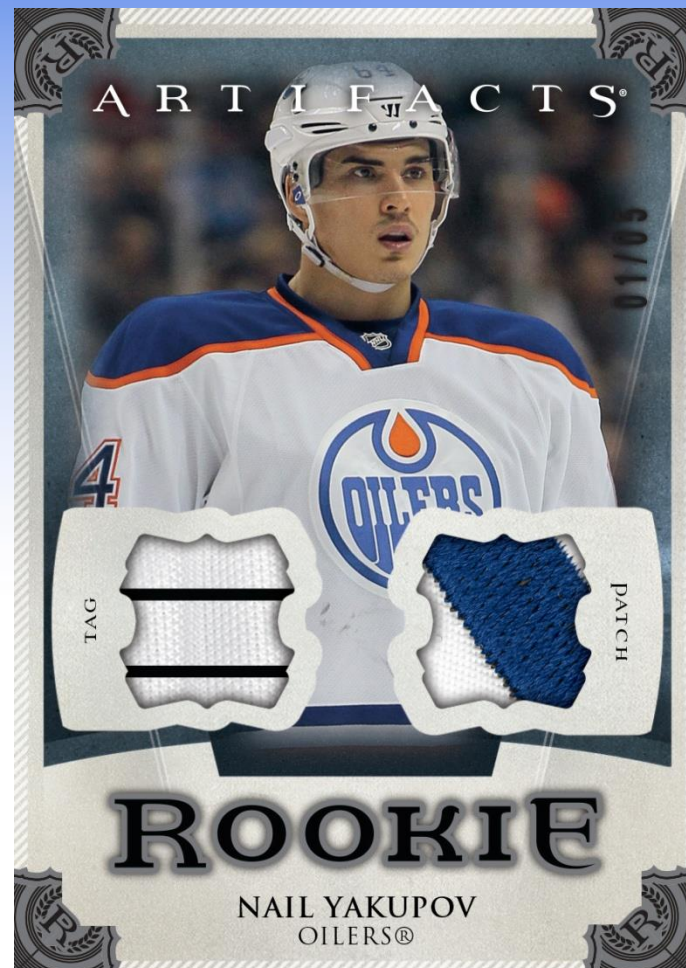
Rookie Materials – Tag-Patch card