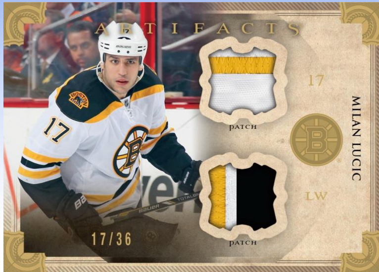
Horizontal Memorabilia Variation