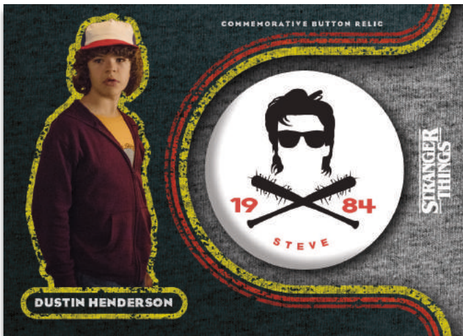
Hobby Commemorative Button Card

2 HITS PER HOBBY BOX, WITH 1 GUARANTEED AUTOGRAPH OR SKETCH CARD PER BOX