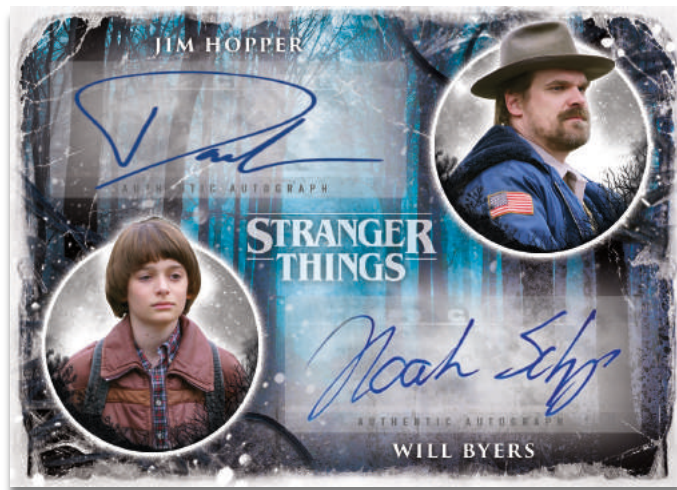
Dual Autograph Card