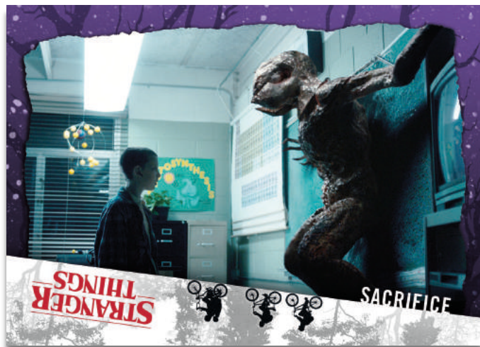
Base Card – Purple Parallel