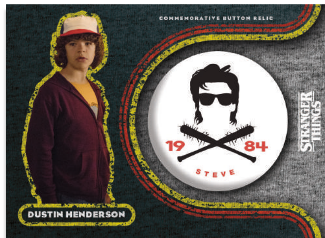
Hobby Commemorative Button Card