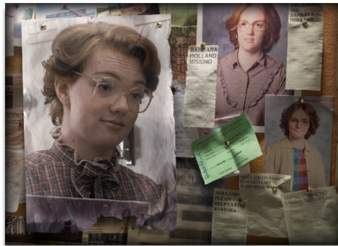
Tribute to Barb Insert Card