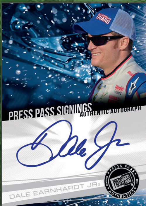
PRESS PASS SIGNINGS

NEW FOR 2014: ONE ON-CARD AUTOGRAPH AND ONE MEMORABILIA CARD IN EVERY HOBBY BOX!