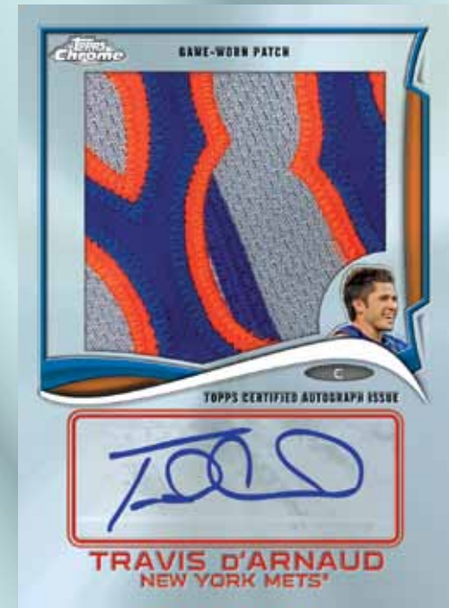
Autographed Relic Patch Base Card Variation