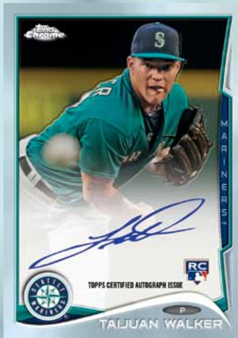
Autographed Rookie Refractor Card