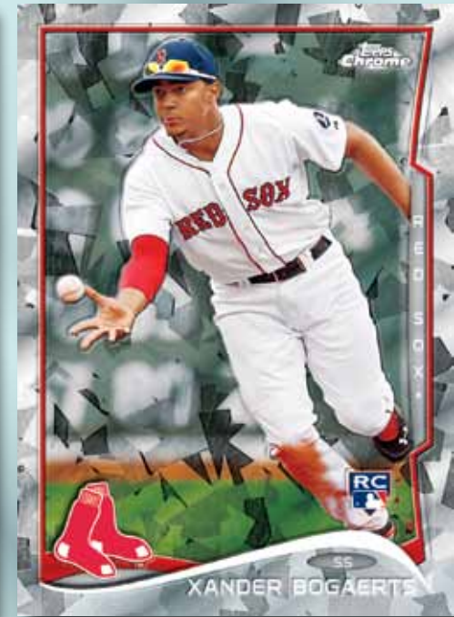
Base Atomic Refractor Card