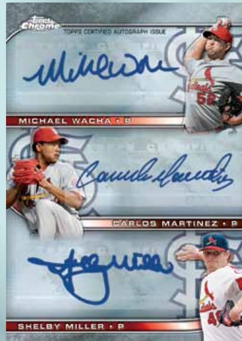
Triple Autographed Card