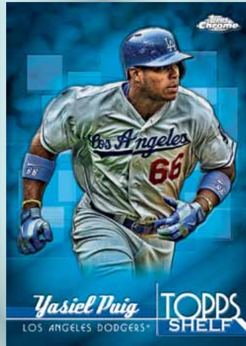
Topps Shelf Insert Card