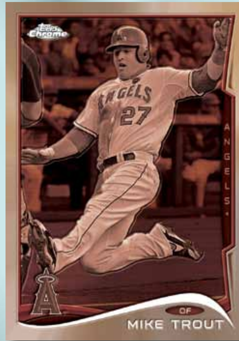
Base Sepia Refractor Card