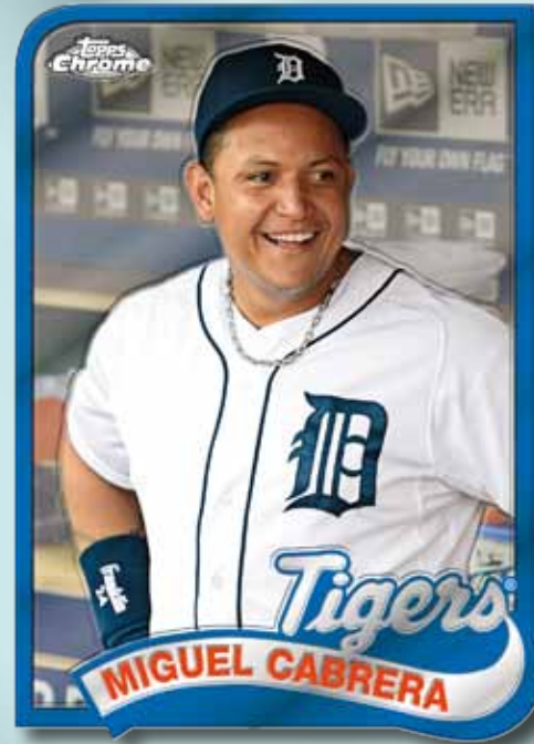
1989 Topps Chrome Insert Card