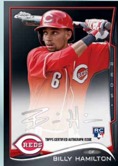
Autographed Rookie Silver & Black Refractor Card

Refractor numbered to 499. Blue Refractor numbered to 199. Black Refractor numbered to 100. Sepia Refractor numbered to 75. Gold Refractor numbered to 50. Red Refractor numbered to 25. Silver & Black Refractor numbered to 25. Signed in silver ink. NEW! Atomic Refractor numbered to 10. HOBBY & HOBBY JUMBO ONLY Super-Fractor numbered 1/1. HOBBY & HOBBY JUMBO ONLY Printing Plates numbered 1/1. HOBBY & HOBBY JUMBO ONLY