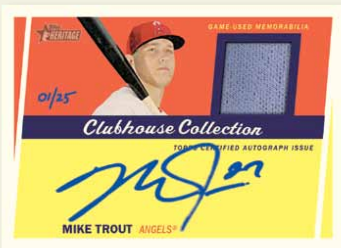
Clubhouse Collection Autograph Relic Card