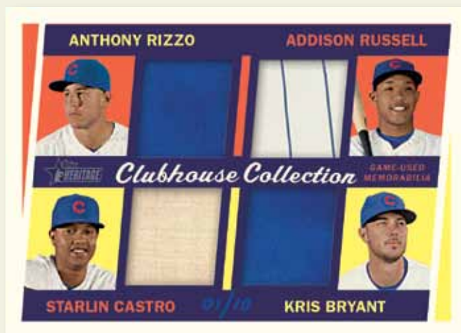
Clubhouse Collection Quad Relic Card