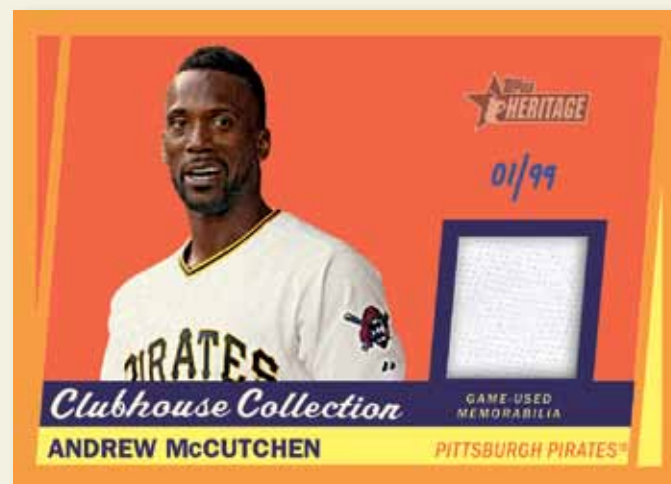
Clubhouse Collection Relic - Gold Parallel