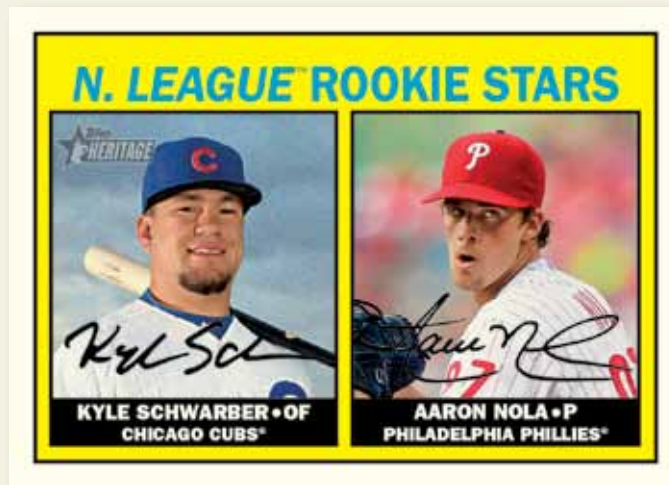
Base Card – Rookie Stars