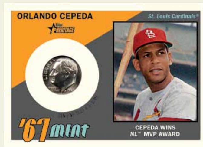
1967 Mint Card