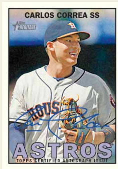
Real One Autographed Card