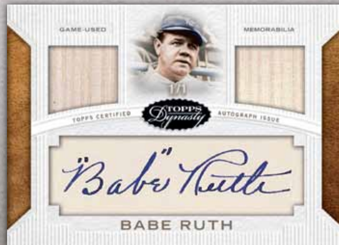
Dual Relic Legend Cut Signature Cards