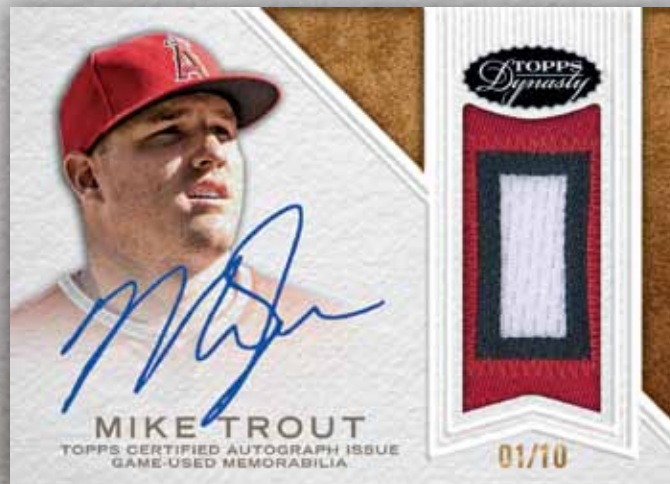
Autographed Patch Card

THE GREATEST HIGH-END BRAND IN BASEBALL IS BACK FOR ANOTHER SEASON!