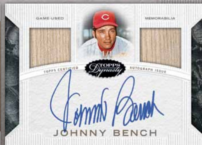
Autographed Dual Relic Great Cards