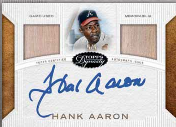
Autographed Dual Relic Great Cards

Up to 100 Cut Signatures from some of the greatest baseball players of all time! Seq #d 1/1