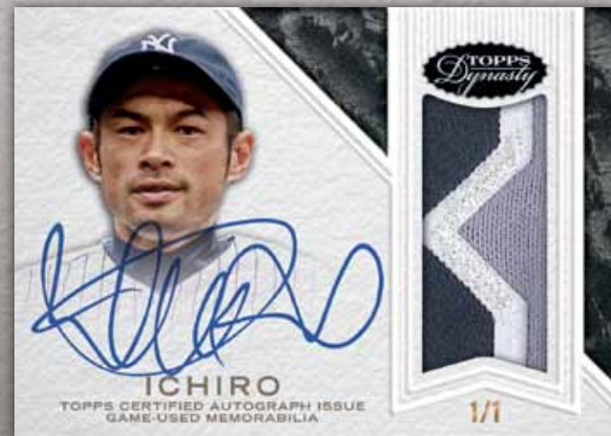
Autographed Patch Cards