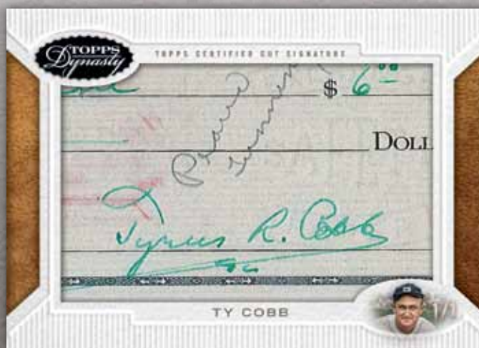
Cut Signature Cards