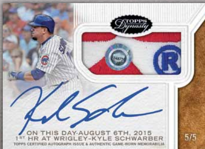
On This Day Autographed Card