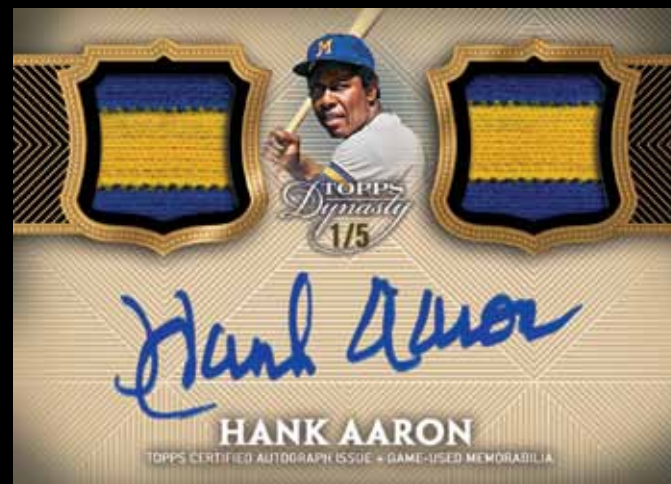
Autographed Dual Relic Card

Includes 2 autographs and 2 patches from the game’s best. Sequentially #’d to 5 with a 1-of-1 parallel.