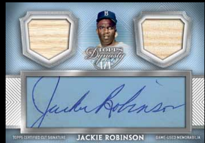
Dual Relic Cut Signature Card