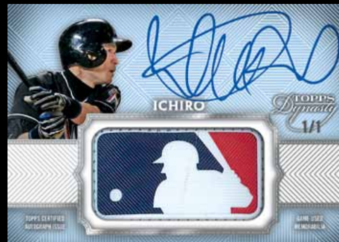
Dynasty Autographed MLB ® Silhouetted Batter Logo Patch Card