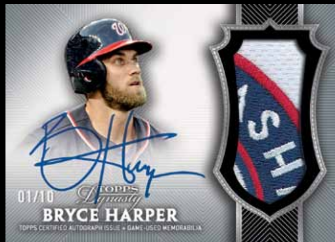
Autographed Patch Cards