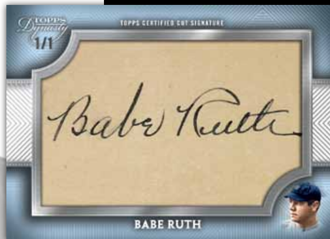
Cut Signature Card