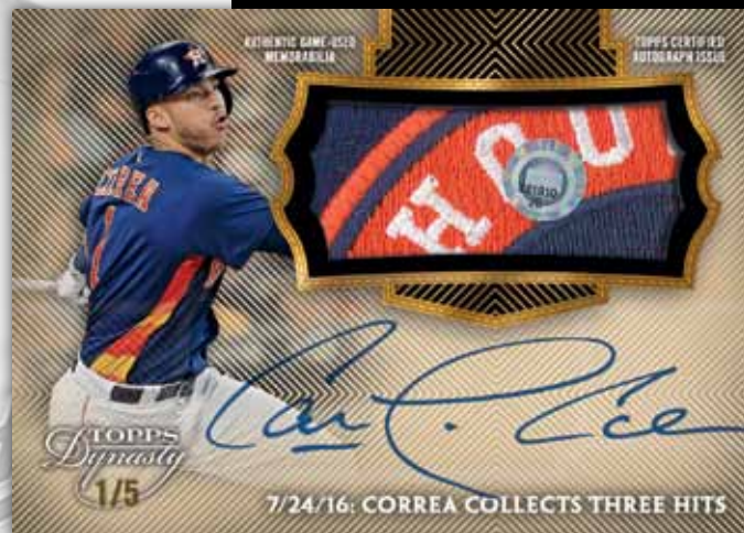
On This Day Autographed Patch Card