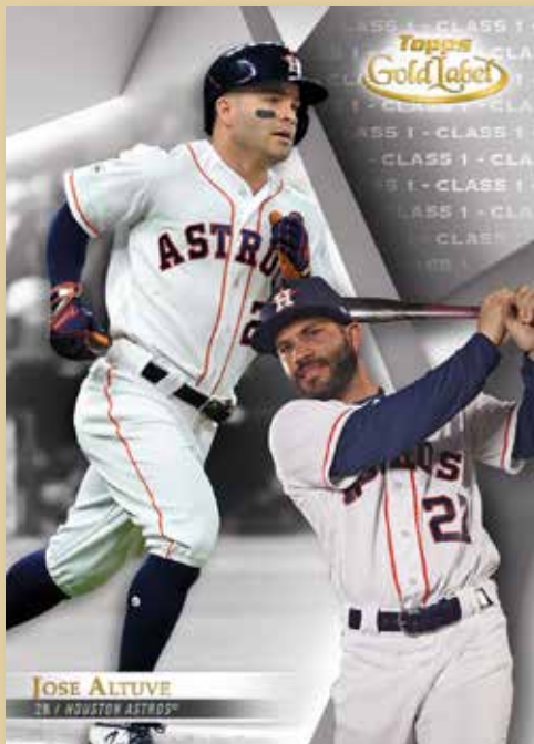
Class 1 Card

Class 1 – #'d 1/1 Class 2 – #'d 1/1 Class 3 – #'d 1/1