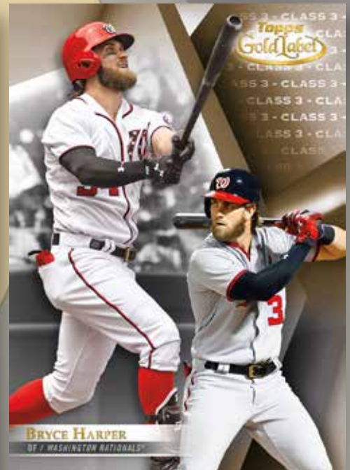
Class 3 Card - Gold Parallel