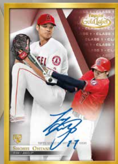
Framed Autograph Card - Red Parallel

MAKE YOUR PURCHASE FOR 2018 TOPPS GOLD LABEL TODAY PRODUCT AVAILABLE IN SEPTEMBER 2018