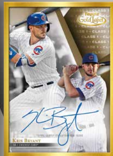
Framed Autograph Card