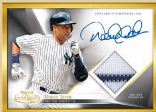
Golden Greats Framed Autograph Relic Card