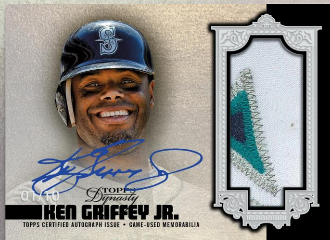
Dynasty Autographed Patch Card