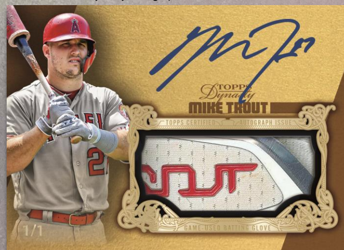
Dynasty Autographed Batting Glove Card