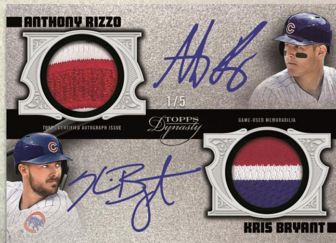
Dynasty Autographed Dual Relic Card