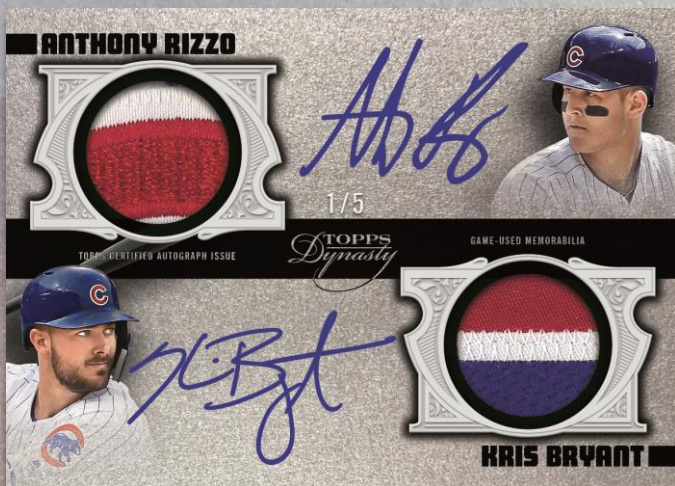
Dynasty Dual-Autographed Patch Card

The award-winning Topps Dynasty returns in 2019, featuring all autographed patches signed on card, and numbered to 10 or less.