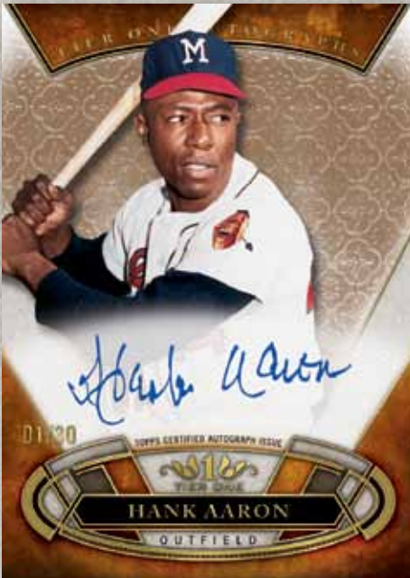
Tier One Autograph Card

Every single- and dual-subject autographed card is signed ON-CARD!