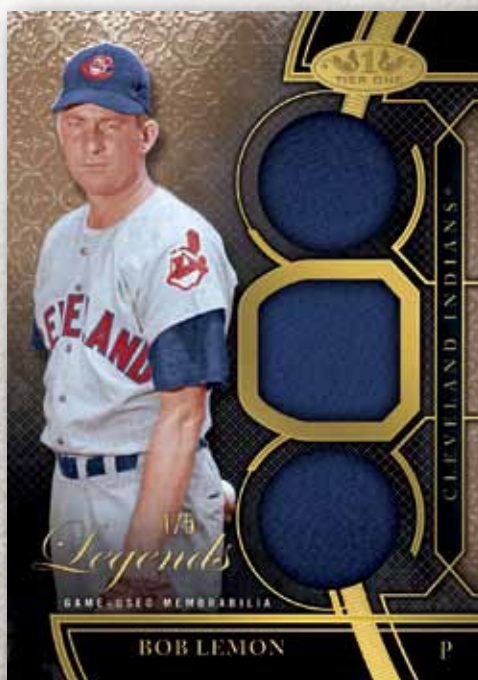
Tier One Legends Relics - Triple Swatch Parallel