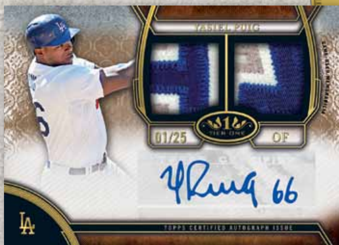
Autographed Tier One Relic - Dual Patch Parallel