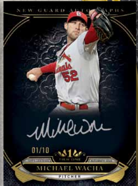
New Guard Autograph - Silver Ink Parallel

Tier One Autographs More than 20 of the best players of all time will sign on-card. Sequentially numbered no higher than 99. Signed in blue ink.