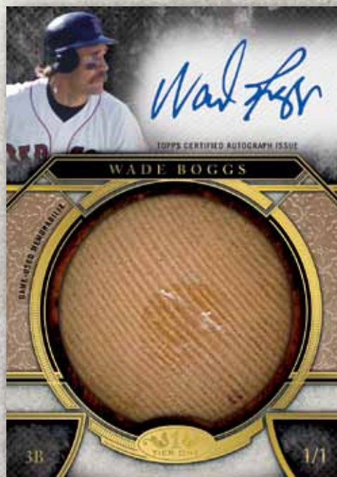
Tier One Autographed Bat Knobs