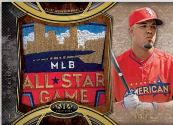
Tier One All-Star Relic

Limited Lumber Up to 100 active and retired superstars with unique bat pieces. Numbered 1/1.