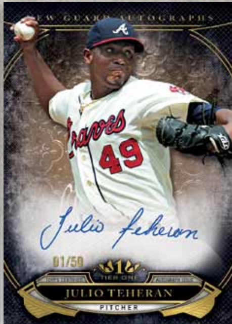
New Guard Autograph