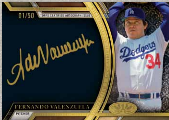
Acclaimed Autograph - Base