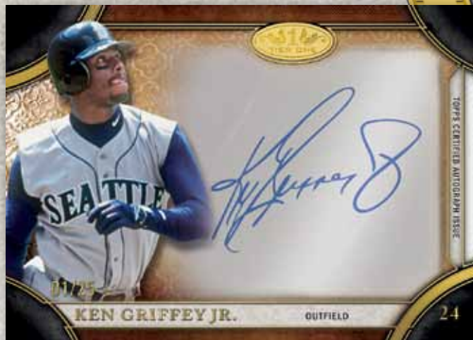
Clear One Autograph

Clear One Autographs 20 of the game's biggest stars will sign on card on a unique, multi-layered card. Numbered to 25.