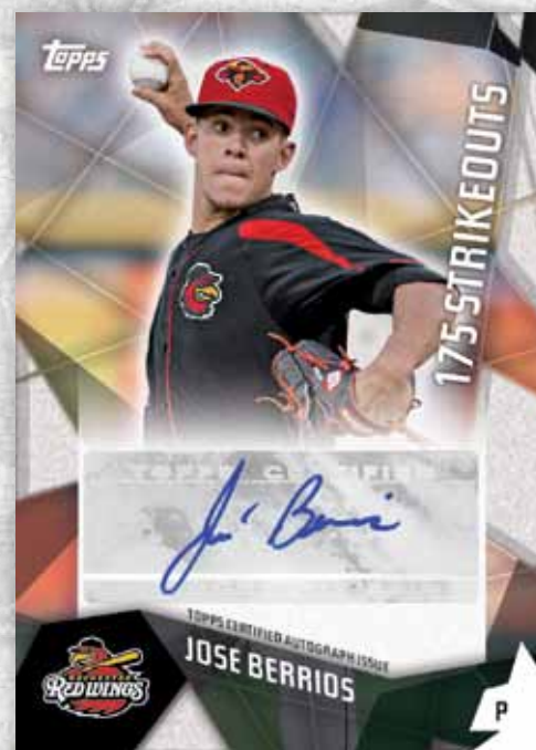
Pro Production Autograph Card