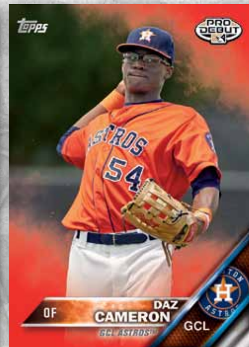
Base Card - Red Parallel

LOOK FOR 2016 TOPPS PRO DEBUT™ BASEBALL IN JUNE 2016!