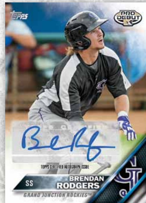
Pro Debut ™ Autograph Card - Black Parallel