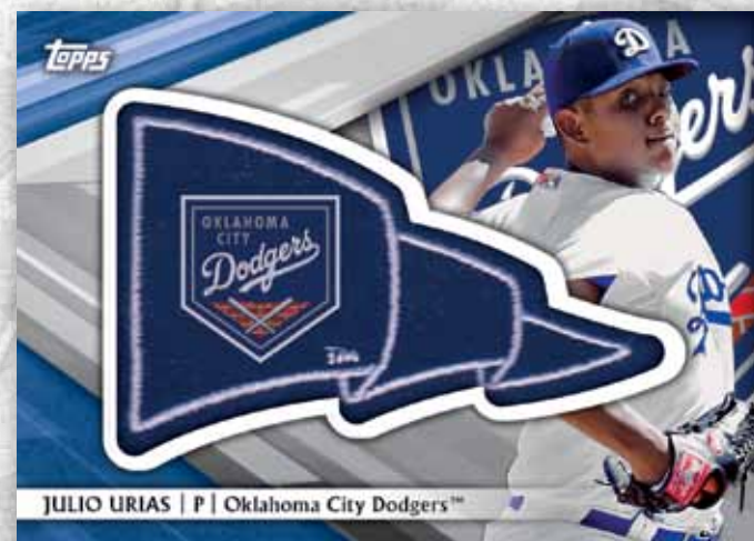
Pennant Patches Relic Card