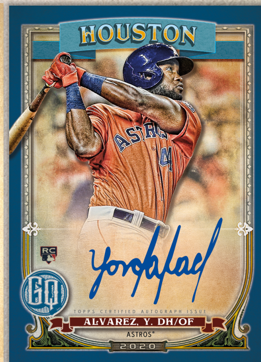
Autograph Card – Blue Parallel