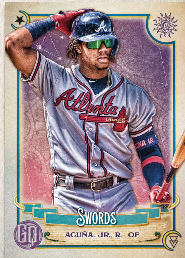
Tarot of the Diamond Card