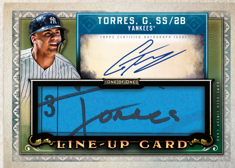
Autograph Lineup Card

Power Performers Portrait Art Patch Originals - #’d to 1