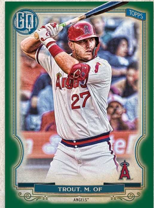
Base Card – Green Parallel