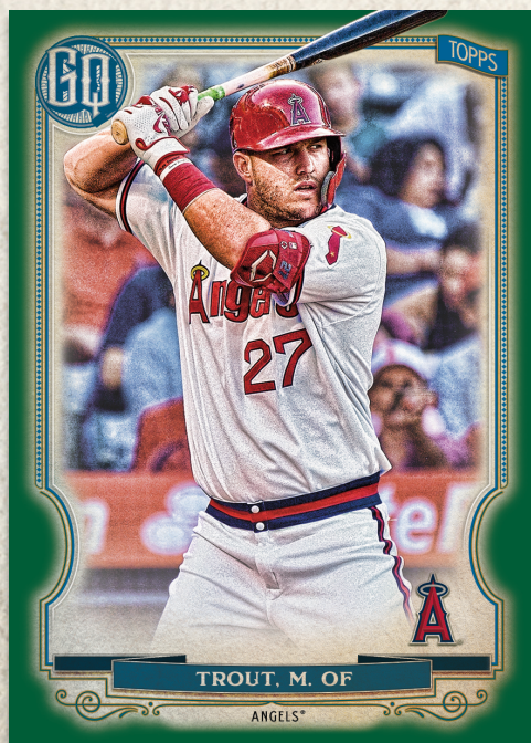
Base Card – Green Parallel