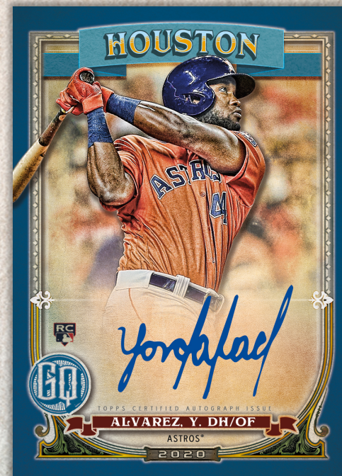
Autograph Card – Blue Parallel