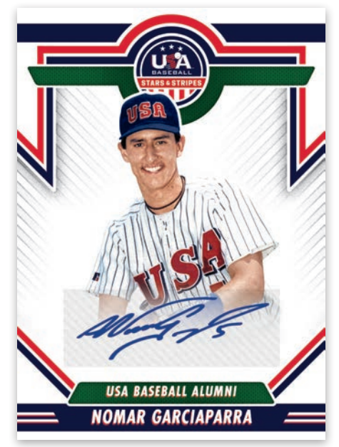
Card images are solely for the purpose of design display.