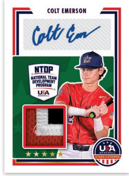
Card images are solely for the purpose of design display.