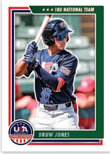
Card images are solely for the purpose of design display.