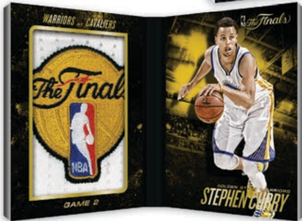
2015 NBA FINALS