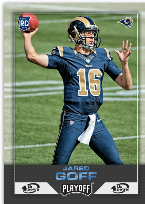
ROOKIES 4TH DOWN