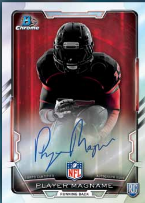
Rookie Chrome Refractor Autograph Card