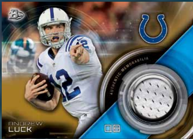
Bowman Relic Card - Gold Parallel