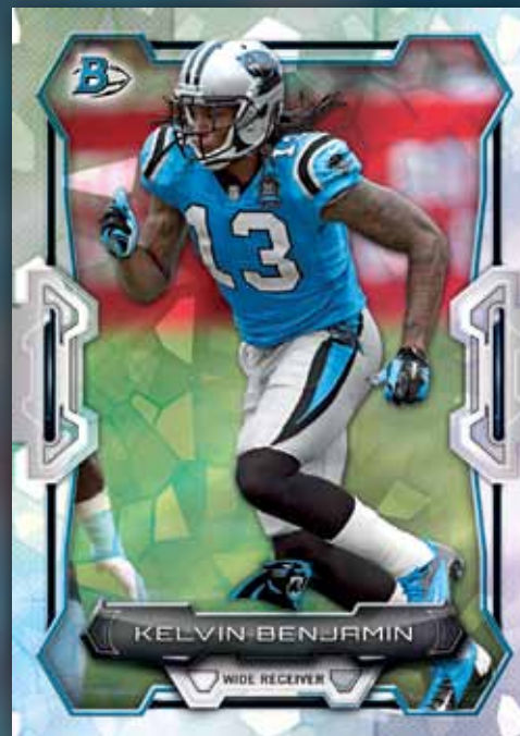
Veteran Rainbow Foil Silver Ice Parallel Card

Black Bordered Parallel: 2 PER PACK HOBBY ONLY! Blue Bordered Parallel: Numbered. Gold Bordered Parallel: Numbered. Orange Bordered Parallel: Numbered. Red Bordered Parallel: #'d to 25. Green Bordered Parallel: #'d 1/1.