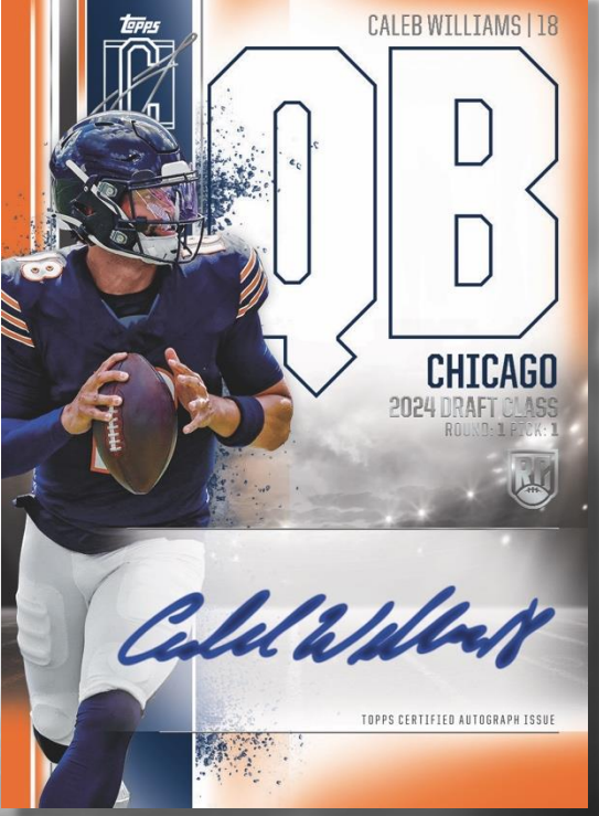
Rookies Class Autograph Variation – Orange