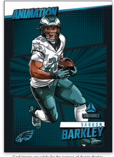
Card images are solely for the purpose of design display.