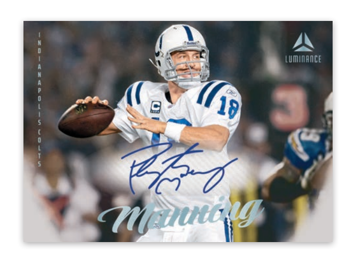
Card images are solely for the purpose of design display.