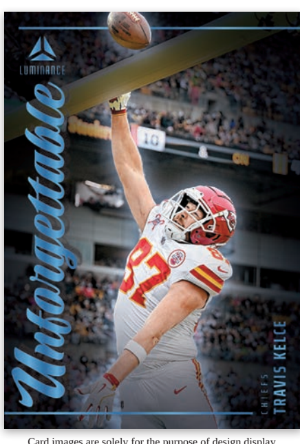
Card images are solely for the purpose of design display.