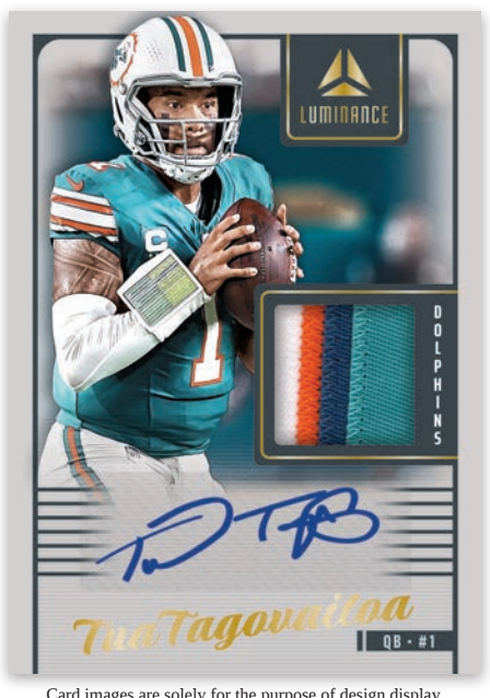
Card images are solely for the purpose of design display.