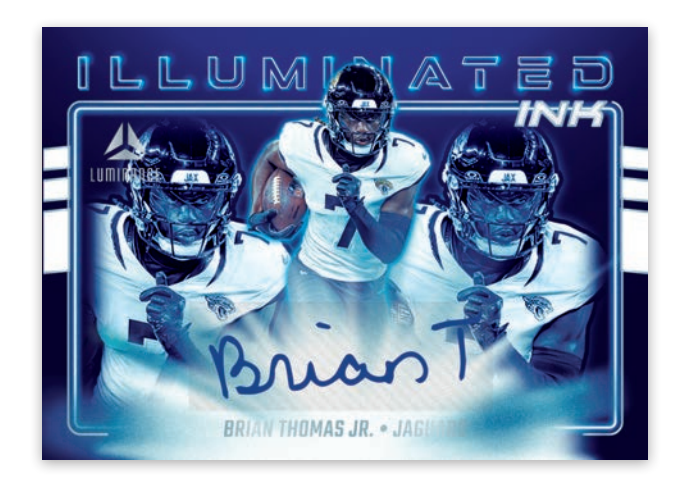
Card images are solely for the purpose of design display.