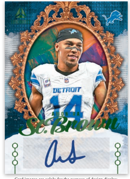
Card images are solely for the purpose of design display.