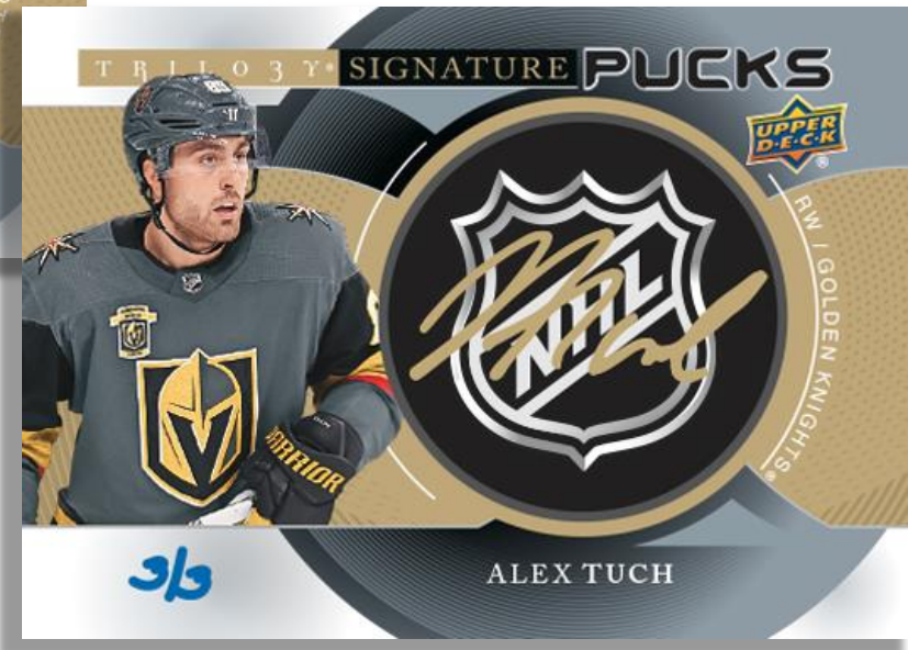
Signature Pucks NHL Logo Parallel [#'d to 3]