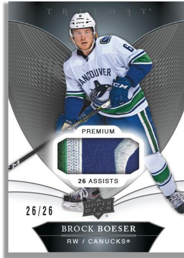
Black Premium Materials Relic Base Parallel [#'d to Player's season stats]