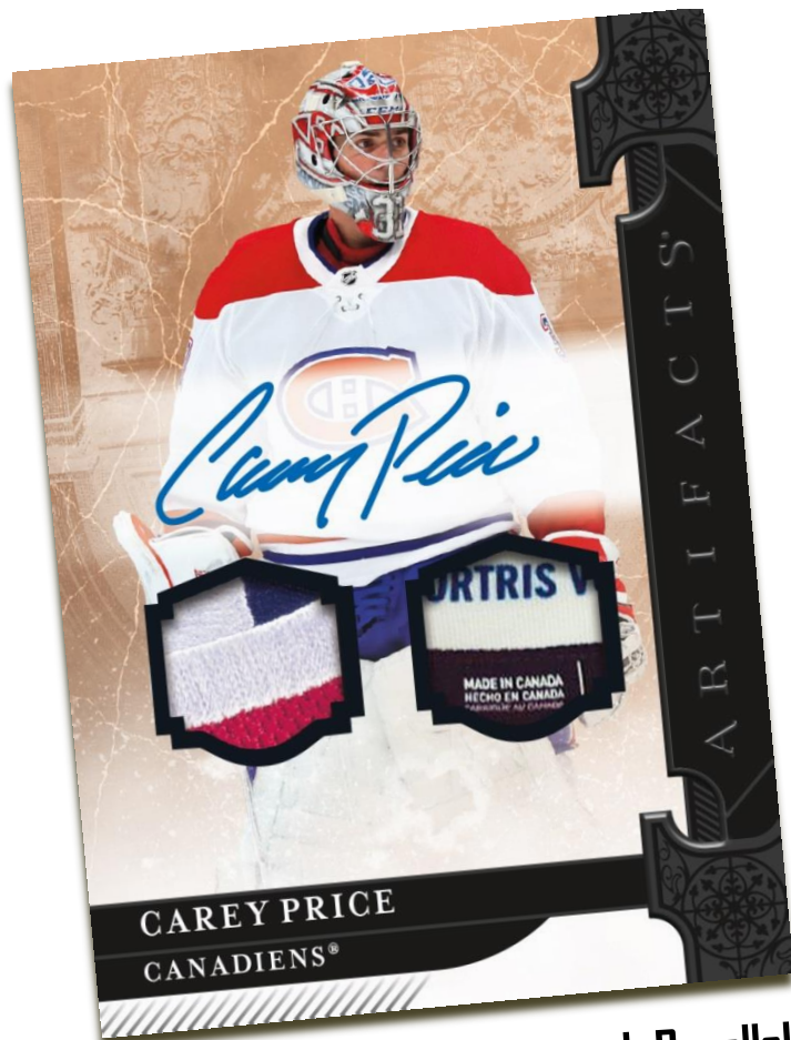
Stars Material Black Autograph Parallel (Premium-Premium)