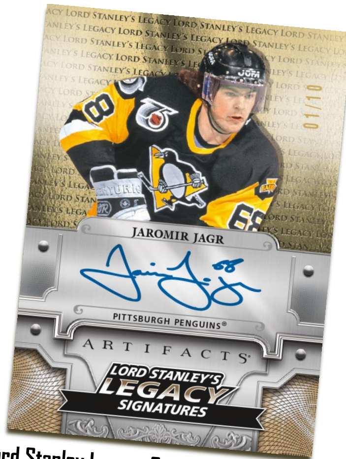
Lord Stanley Legacy Signatures Parallels (#'d to 10)