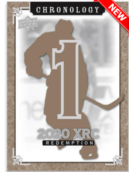
2020 #1 XRC Redemption Card

Loaded with surefire hits, the Franchise History Auto insert features a stellar checklist, hard-signed autographs and team-based prefixes. The checklist includes current stars and retired stars not included in Vol. I. Also keep an eye out for the ALL NEW XRC Rookie and XRC Rookie Auto Redemption cards for the top 2020 draftees!