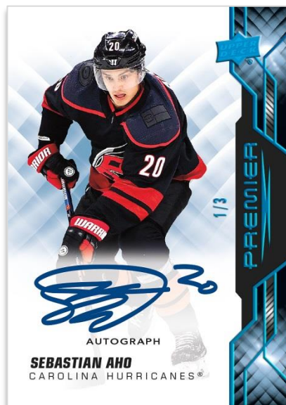
BASE SET Platinum Blue Spectrum Auto Parallel

This Base Set parallel features the 50 top rookies in the 2019-20 class divided into two tiers – Tier 1, numbered to 49, and Tier 2, numbered to just 15!