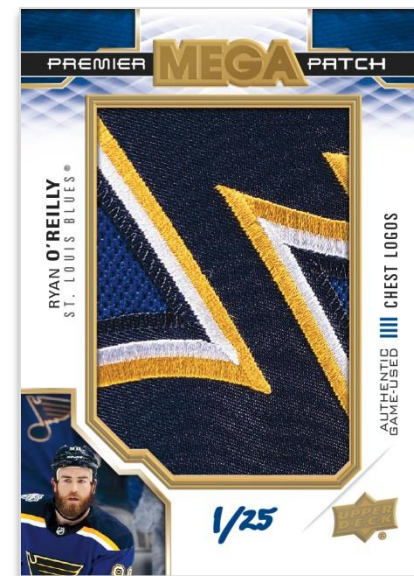
MEGA PATCH Chest Logos

Each card is printed on premium 60-pt. stock, numbered to only 3 and sports a hard-signed autograph from some of the biggest stars in the game today!