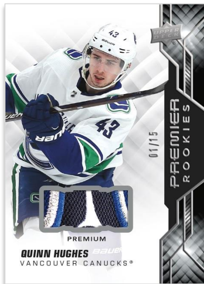
BASE SET ROOKIES Patch Parallel (Tier 2)

This Base Set parallel features the 50 top rookies in the 2019-20 class divided into two tiers – Tier 1, numbered to 49, and Tier 2, numbered to just 15!