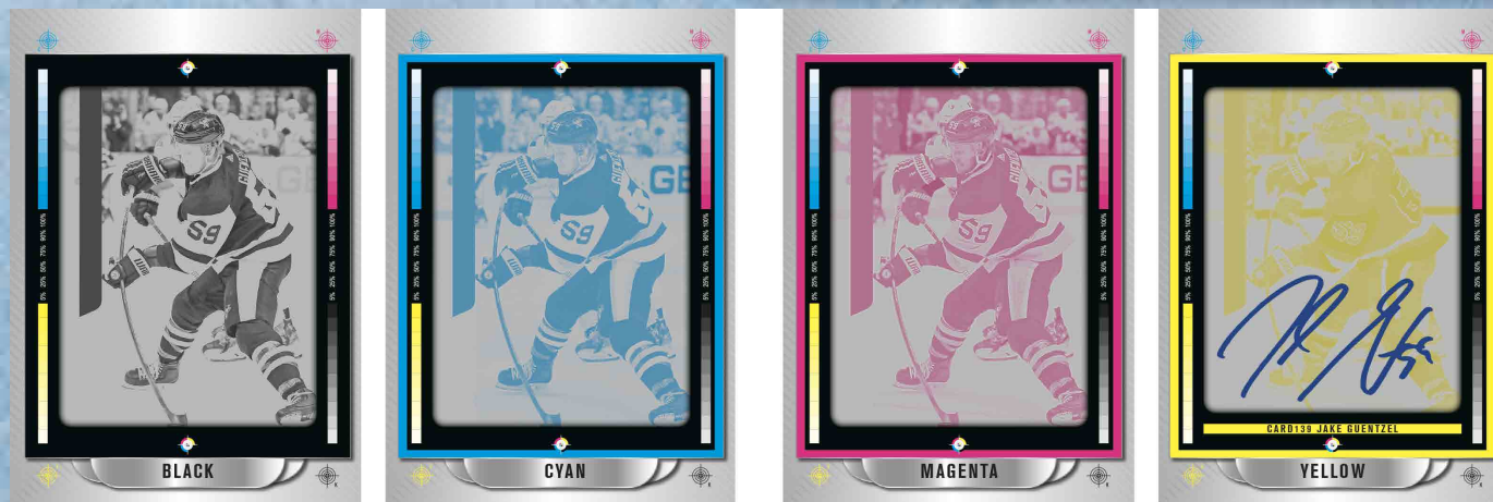
2020-21 UPPER DECK® SERIES 1 & 2 SIGNED PRINTING PLATE BOOKLETS