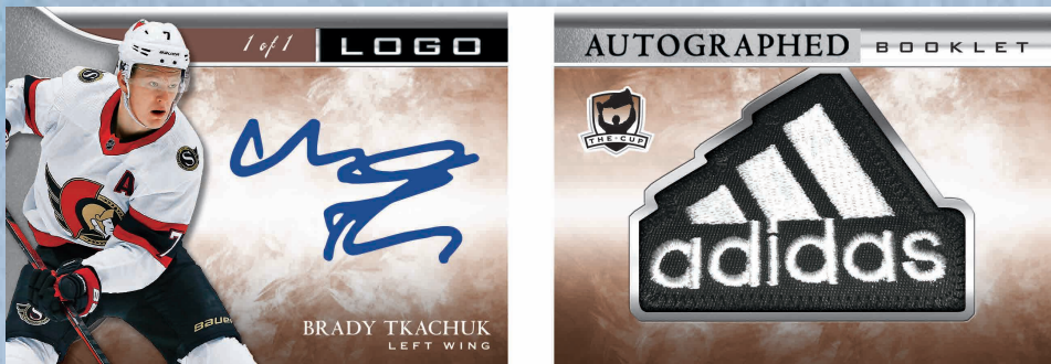
BRAND LOGO AUTOGRAPHED BOOKLETS

THESE THEMED BOOKLETS WILL BE A VALUABLE ADDITION TO ANY COLLECTION