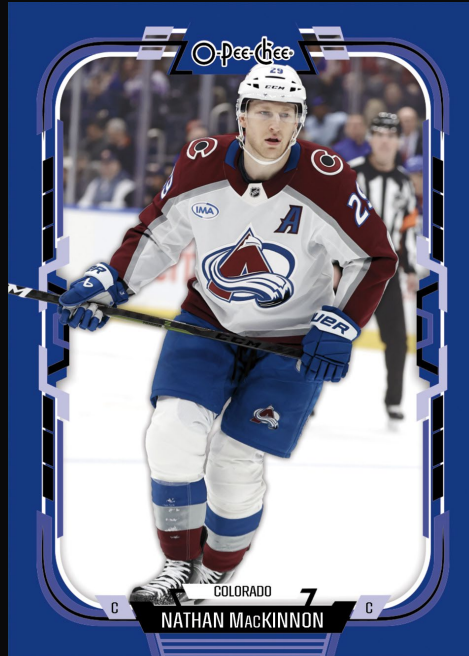
BASE SET Blue Border Parallel