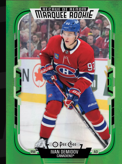
BASE SET - Marquee Rookies Green Rainbow Foil Parallel

O-Pee-Chee boasts a comprehensive 600-card Base Set which includes a 100-card high-series subset featuring only 4 Nations Face-Off™ Stars and 2025-26 Marquee Rookies. Every pack includes, on average, one (1) high series card!