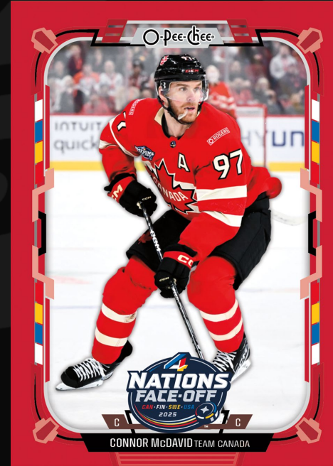
BASE SET - 4 Nations Face-Off™ Stars Red Border Parallel