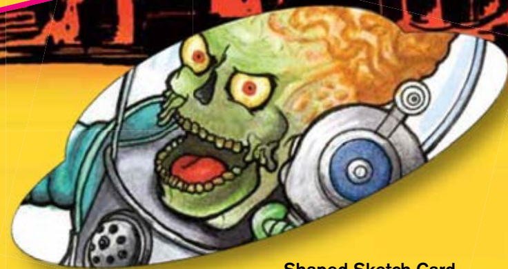
Shaped Sketch Card