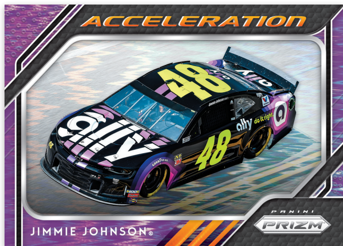
ACCELERATION PURPLE FLASH PRIZM (HOBBY-EXCLUSIVE PARALLEL)