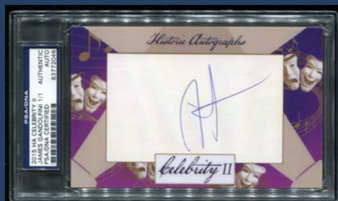
Desirable - James Gandolfini

This is the 1st product ever to feature the cut signature of Macaulay Culkin (an ultra rare modern signature) & there are 9 in the product