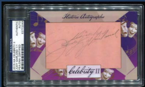
Timeless - Judy Garland