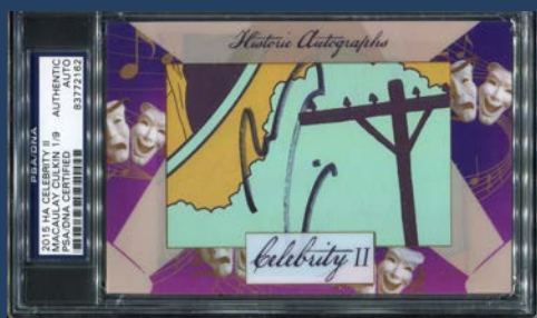
Ultra Rare - Macaulay Culkin