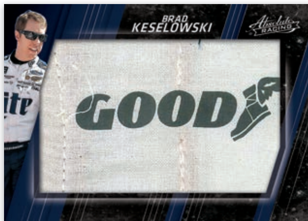
ABSOLUTE PRIME GOODYEAR