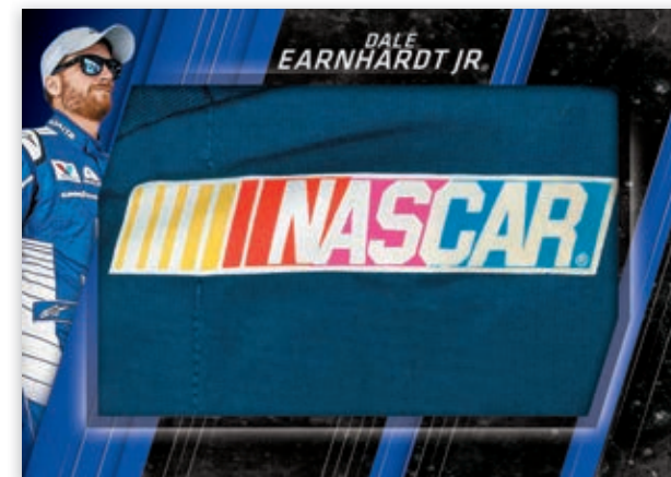
ABSOLUTE PRIME NASCAR

These rare patches are numbered to 2 or less. Included in these patches are Name Plates, NASCAR Bar, Monster Energy Series Patch, Associate Sponsors and more.