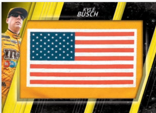
ABSOLUTE PRIME FLAG