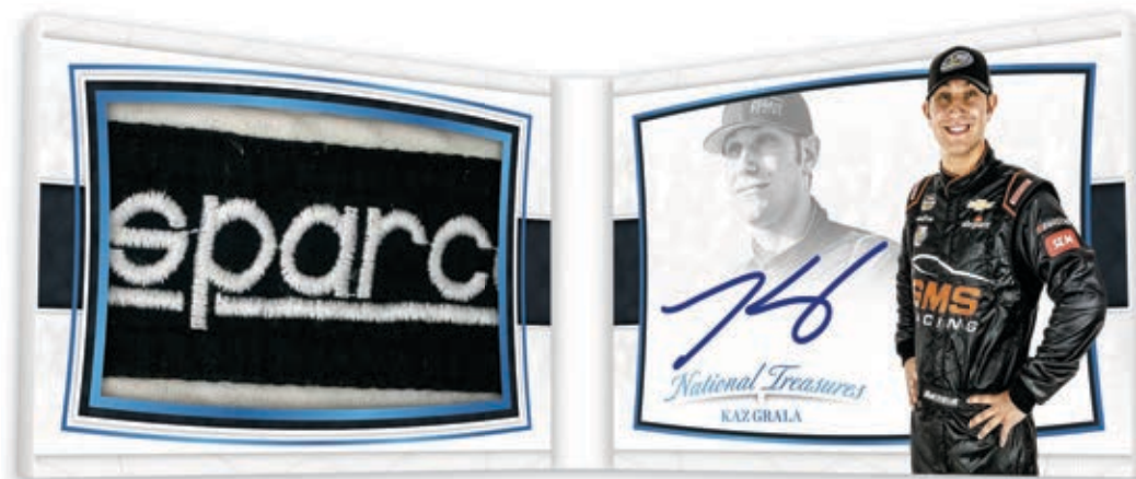
BOOKLET - ASSOCIATE SPONSOR SIGNATURE

Look for signed booklets that feature unique firesuit patches #*/2 or less.