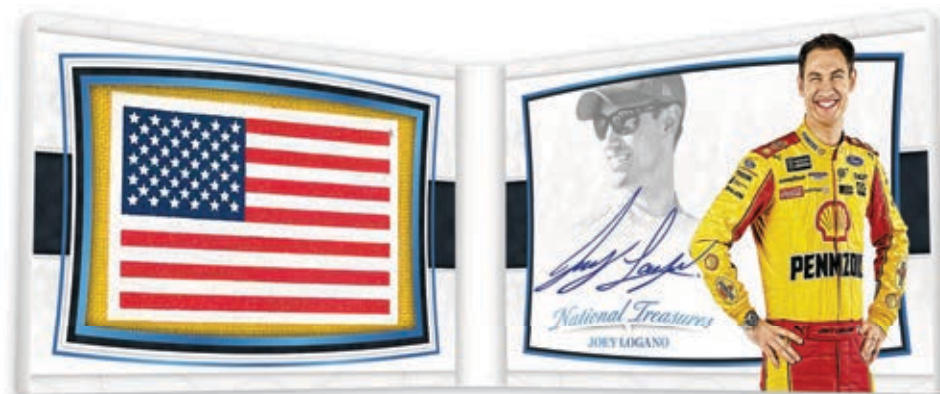
BOOKLET - FLAG PATCH SIGNATURE