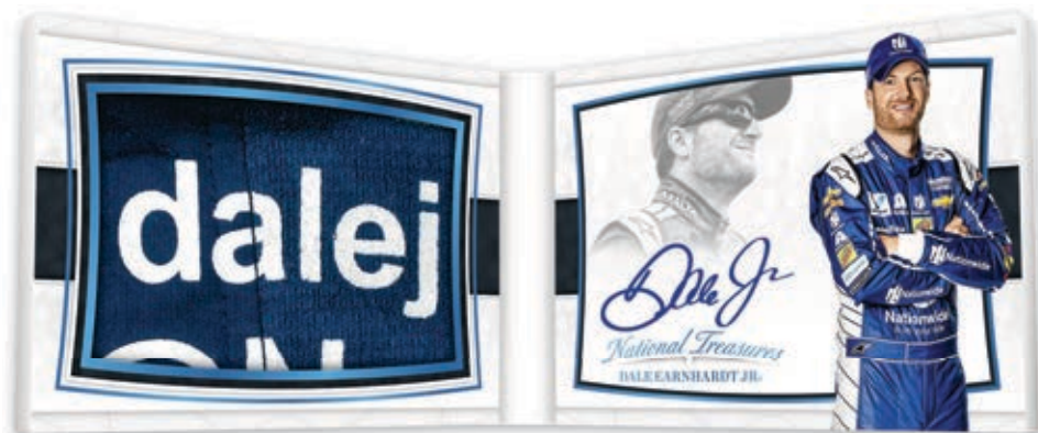
BOOKLET - NAMEPLATE PATCH SIGNATURE