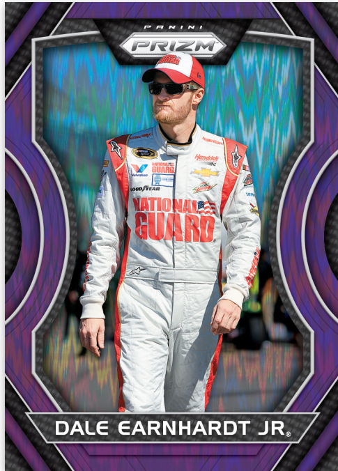
PURPLE FLASH PRIZM