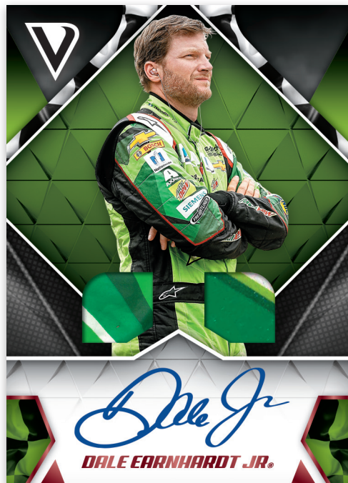
DUAL SWATCH SIGNATURES