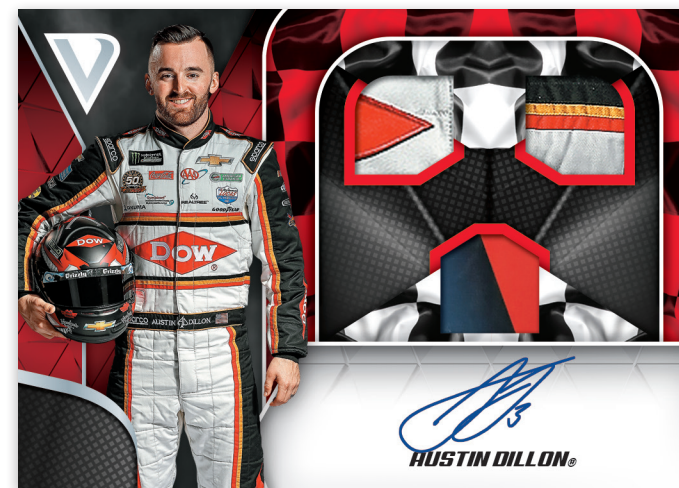
TRIPLE SWATCH SIGNATURES

Whether it's one, two or three swatches Signature Swatches is full of race-used memorabilia paired with an autograph! Each set has the following parallels: