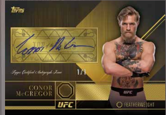
Top of the Class Autograph Card - Gold Parallel