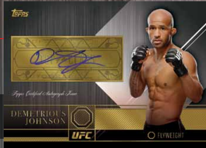
Top of the Class Autograph Card