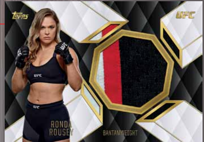
Top of the Class Relic Card