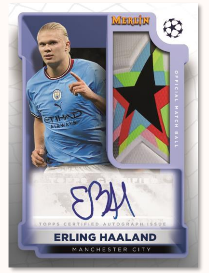
Merlin's Match Ball Signatures