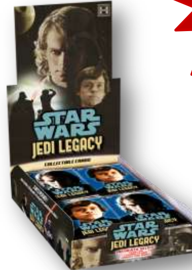
Hobby Box (24 packs) $96 SRP