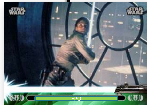
Card Art Not Final