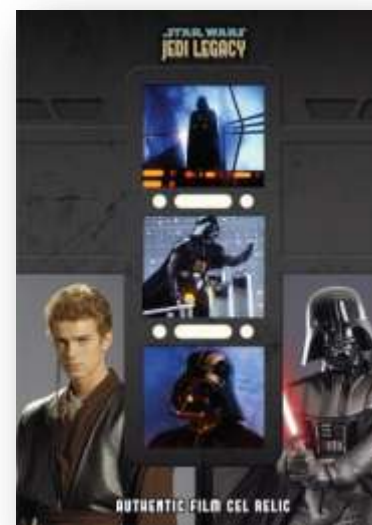
Triple Film Cel