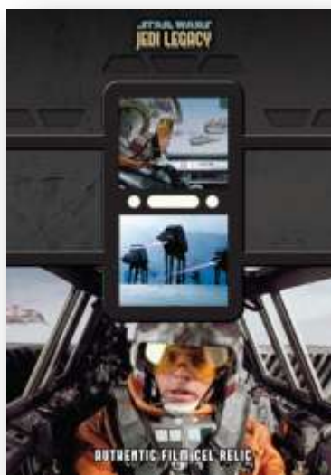
Double Film Cel