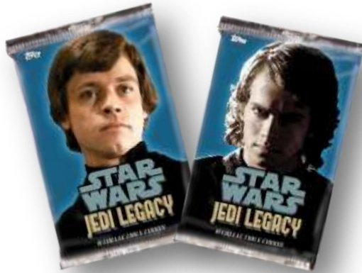
Single Pack (8 Cards) $4 SRP