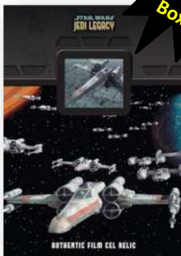
Single Film Cel